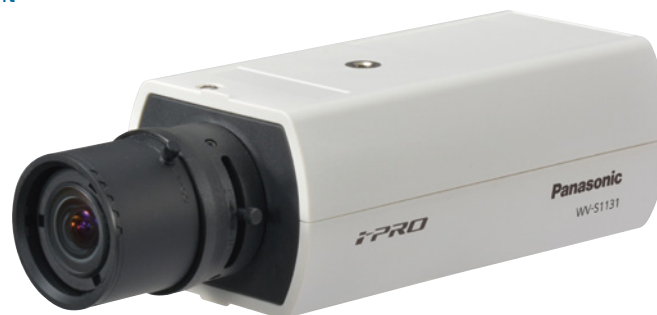
Lens : Optional